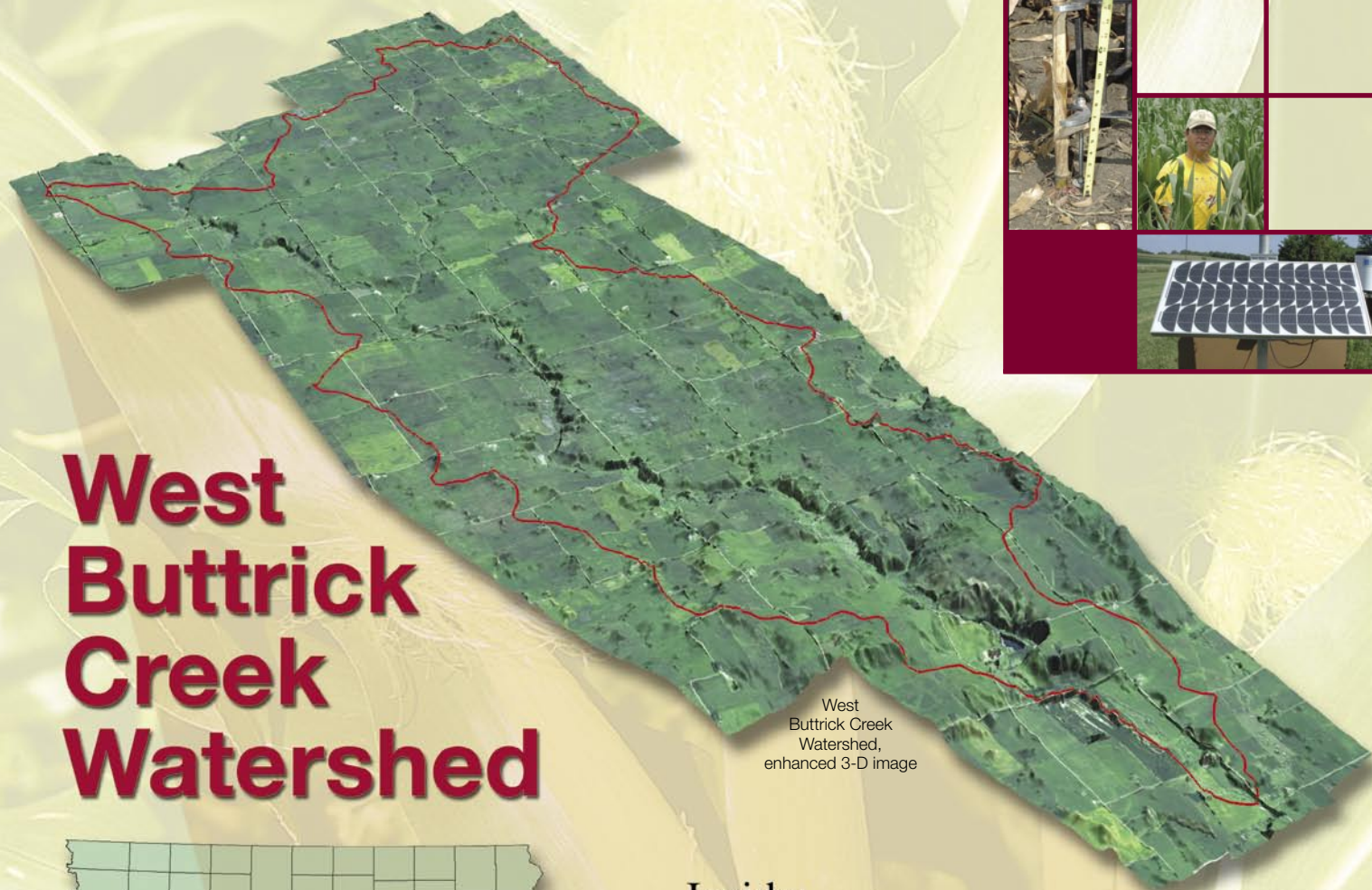
West Buttrick Creek Watershed, enhanced 3-D image